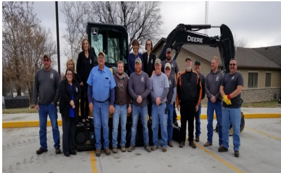
WRWA staff pictured with our mini excavator

The Board of Directors and the Staff of Wapello Rural Water would like to wish you and your families the best in the coming year.